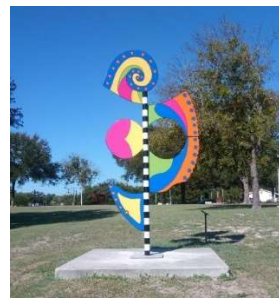
Finalist: Pascale Pryor