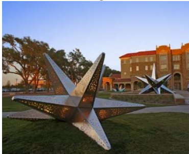
Finalist: Blessing Hancock