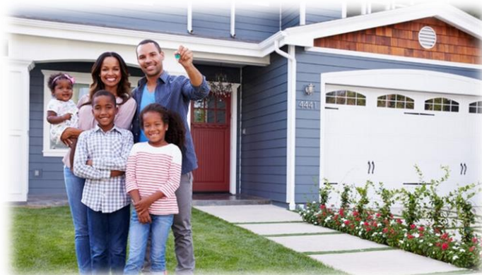
Promote Affordable Housing for Renters and Owners