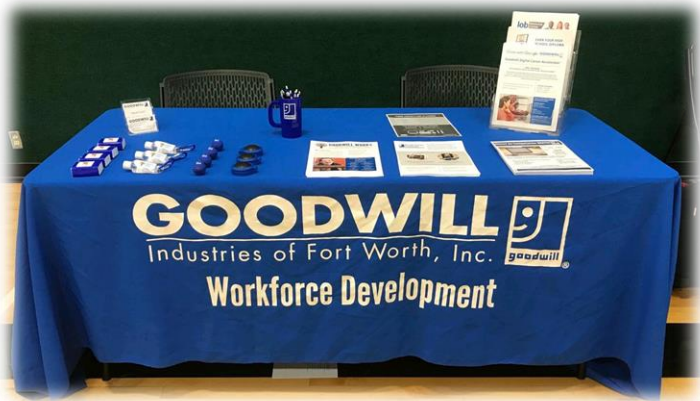
Poverty Reduction and Household Stabilization