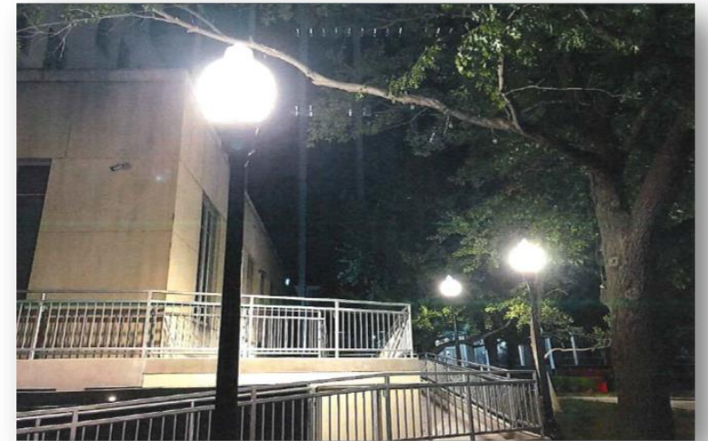
Improve Accessibility of Public/Private Spaces