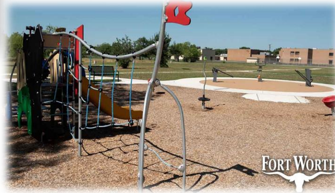
Targeted Neighborhood Revitalization