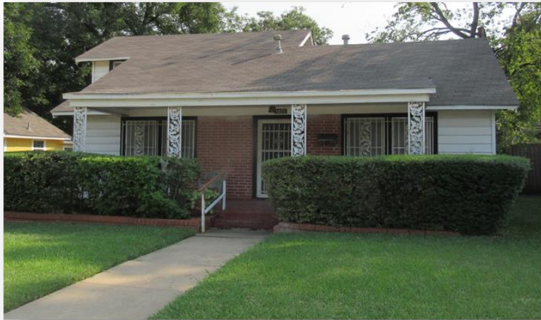
Preserve Aging Housing Stock