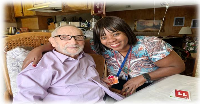
Support Aging In Place