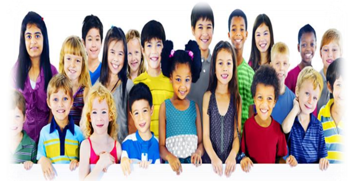
Children/Youth Training and Mentorship