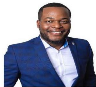
Willie Tedoe Place 6