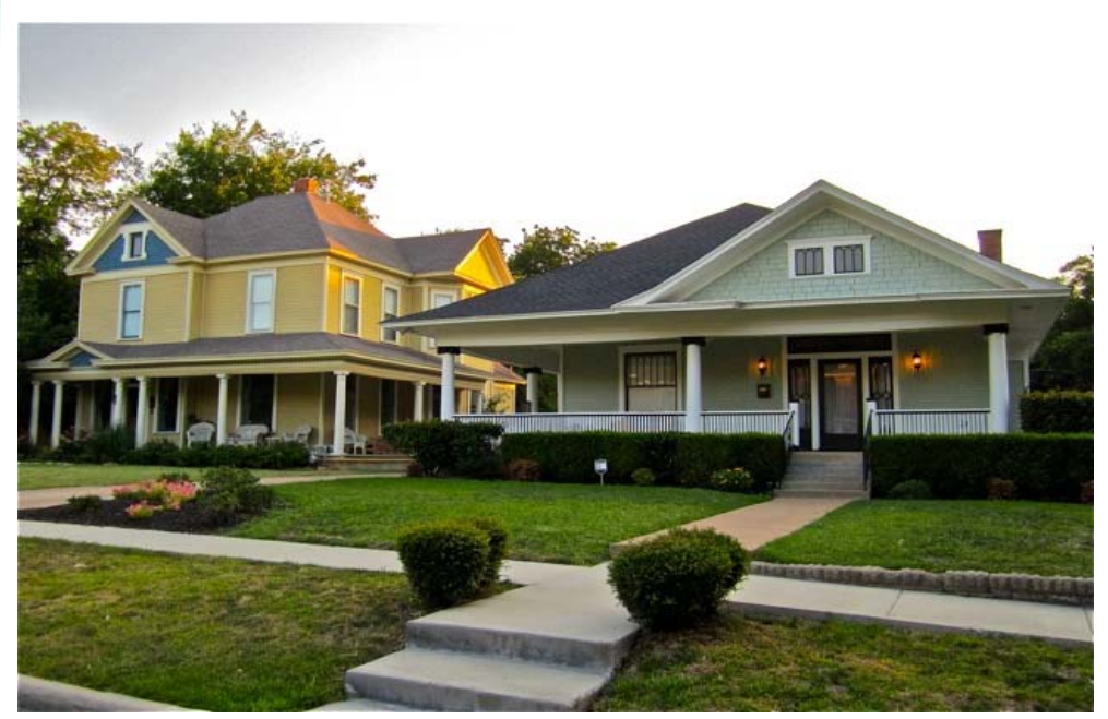
ABOVE: The majority of Fairmount houses are a mix of architectural styles, like these Queen Anne derivatives with classical revival elements.