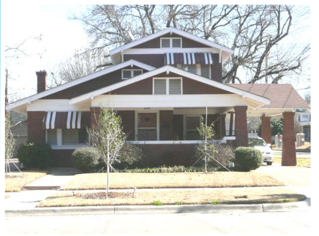
ABOVE: Airplane Bungalow

Other Features: Craftsman doors and windows are similar to those used in vernacular Prairie houses.