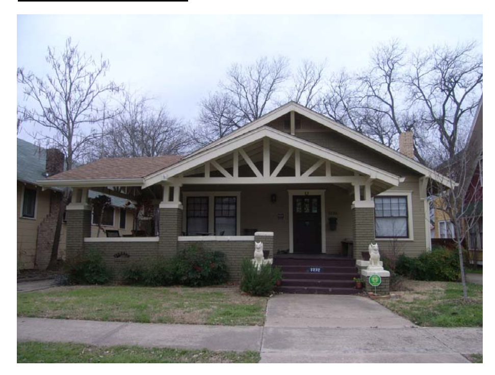
ABOVE: Craftsman or double front gable Bungalow

This was the dominant style for smaller houses built throughout the country during the period from about 1905 until the early 1920s. The craftsman style originated in southern California and most landmark examples are concentrated there. Like vernacular examples of the contemporaneous Prairie style, it was quickly spread throughout the country by pattern books and popular magazines. The style rapidly faded from favor after the mid-1920s and few were built after the 1930s.