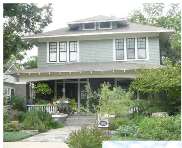
Above Left: American Foursquare with craftsman influence. Above Right: American Foursquare with Classical Revival influence.

Other Features: The American Foursquare is a common vernacular variant of the Prairie style. A large central roof dormer is a common feature of this subtype.