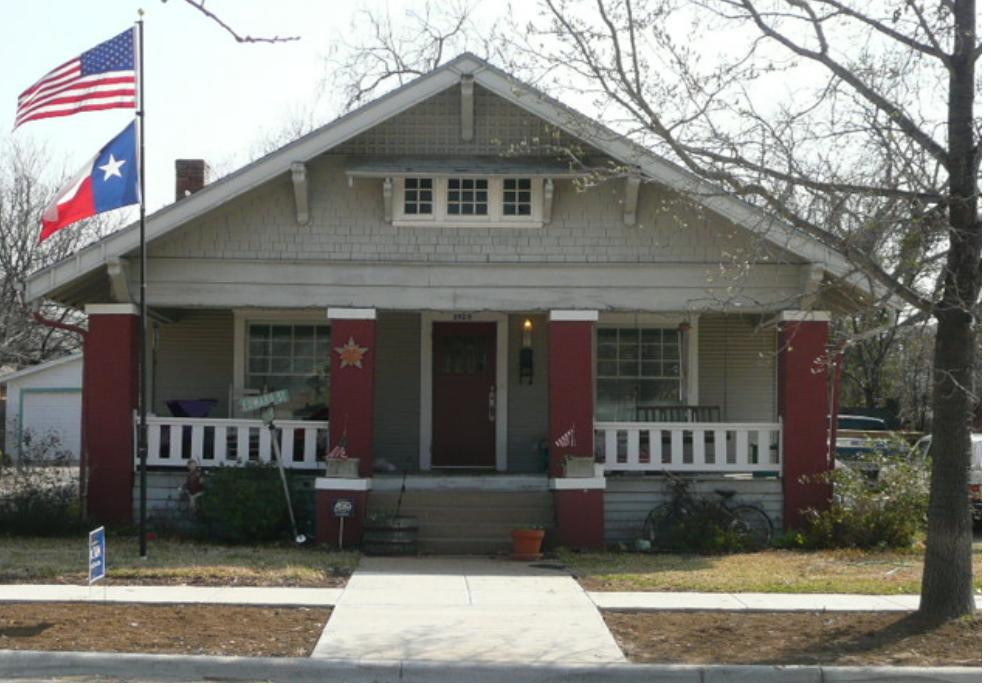
ABOVE: A-frame or front facing gable Bungalow.