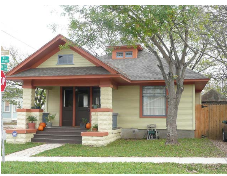
Above: Hipped/ Gable Bungalow