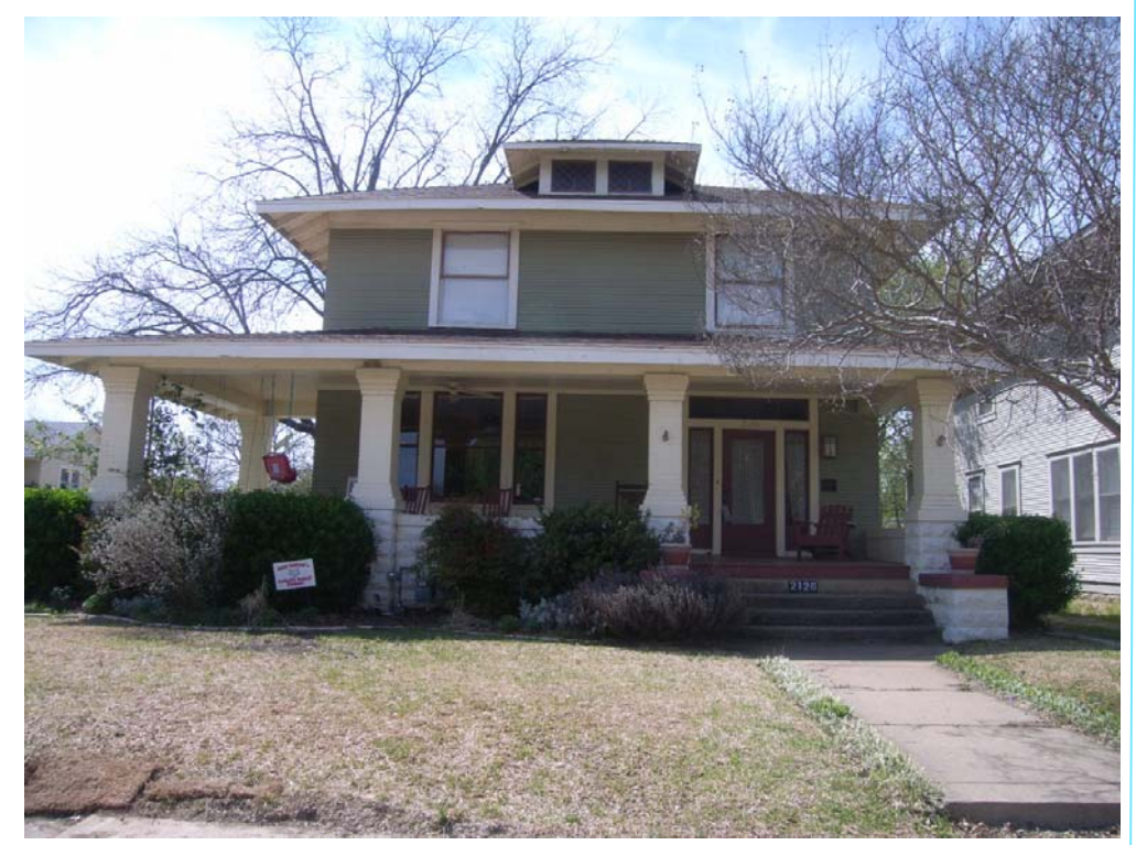
ABOVE: American Foursquare-Prairie Style

The Prairie style originated in Chicago and landmark examples are concentrated in that city's early twentieth century suburbs, particularly Oak Park and River Forest. Examples can also be found in other large Midwestern cities. Vernacular examples were spread widely by pattern books and popular magazines and are common in early twentieth century suburbs throughout the country.