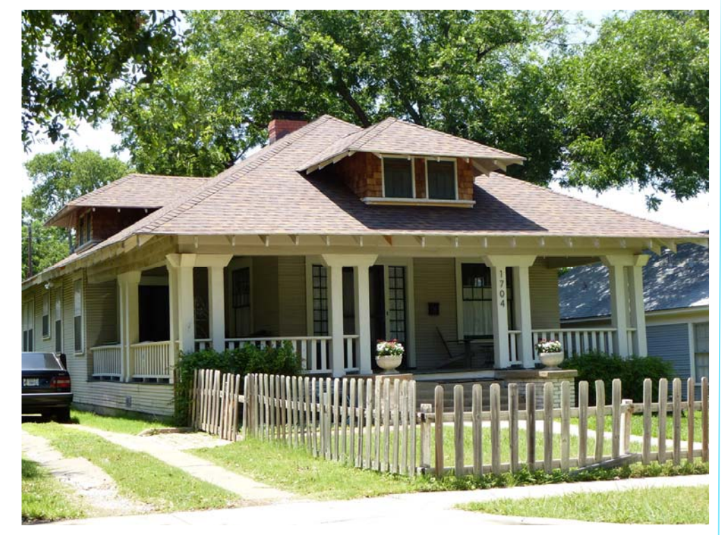
ABOVE: Hipped Roof Bungalow.