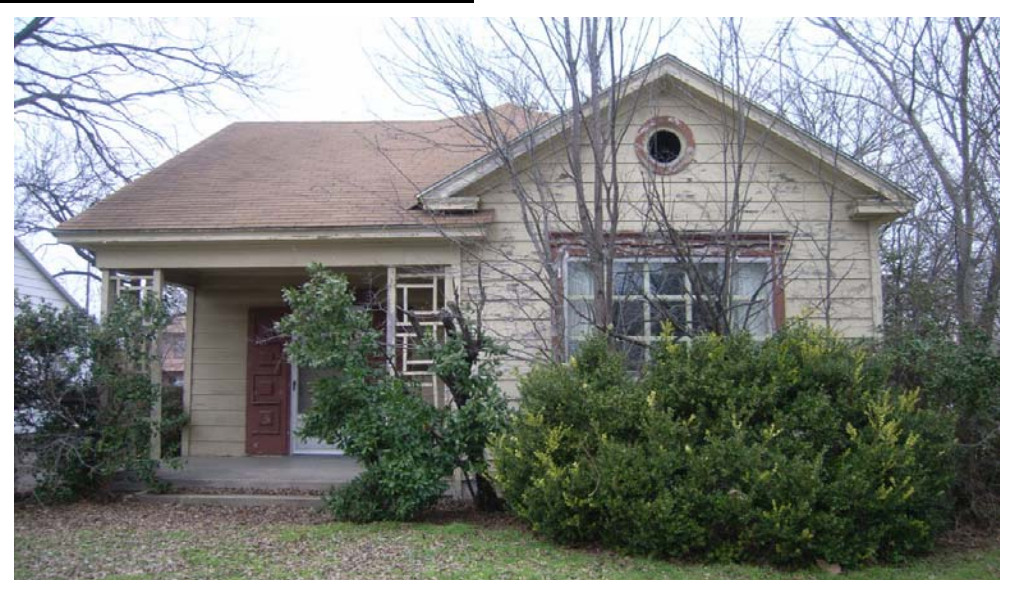
ABOVE: The Minimal Traditional structure has almost no overhangs, a large window and geometric columns, door and shutters.