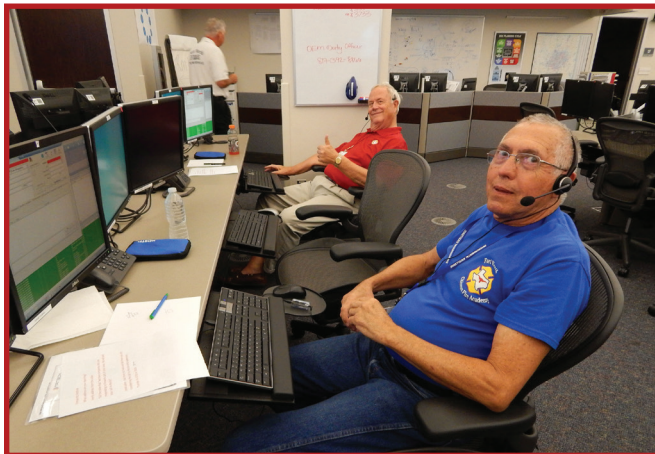
Taking calls for the fireworks hot line.

Graduates support the fire department as volunteers in many capacities. Our volunteers install smoke detectors in area homes free of charge. They provide fire safety education at area events. The volunteers also raise