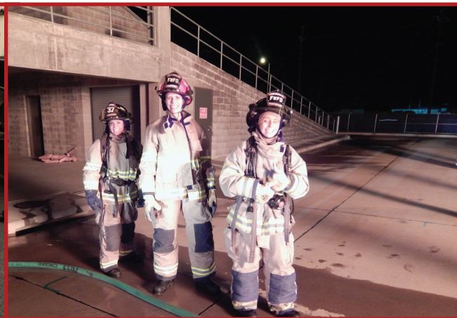
Learning about firefighter equipment and use.

The Citizens Fire Academy Alumni Association (CFAAA) is comprised of graduates of the Fort Worth Citizens Fire Academy.