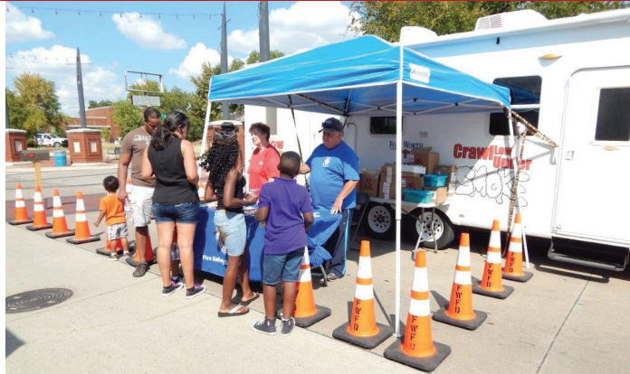
Assisting with community events.

funds to purchase supplies and equipment for the Public Education Section's Fire Safety Education Program. They entertain and educate children about fire safety as clowns or as our fire safety mascot "Sparky." They follow their mission statement: