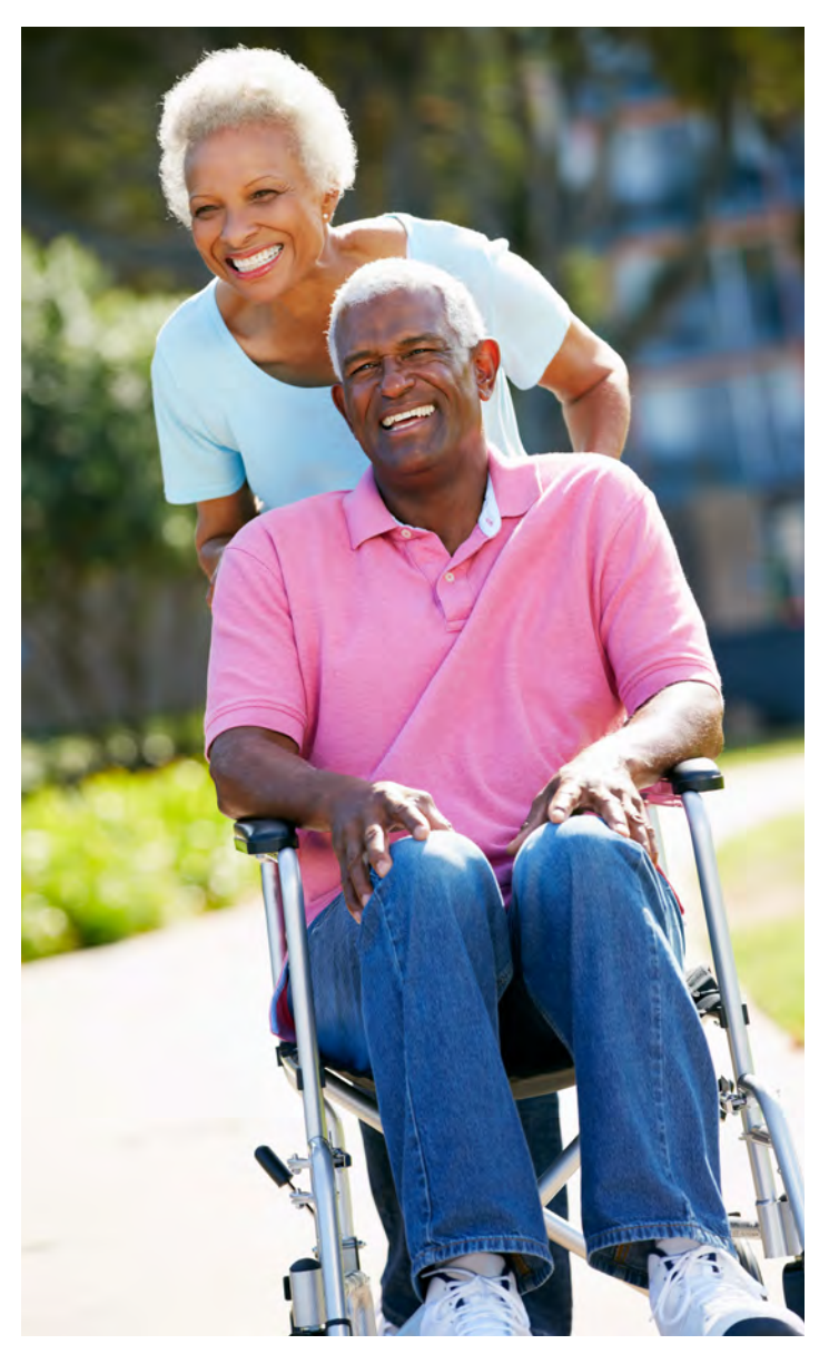
Outdoor spaces and buildings must be accessible for all residents.