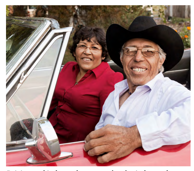
Driving and independence are closely tied together.