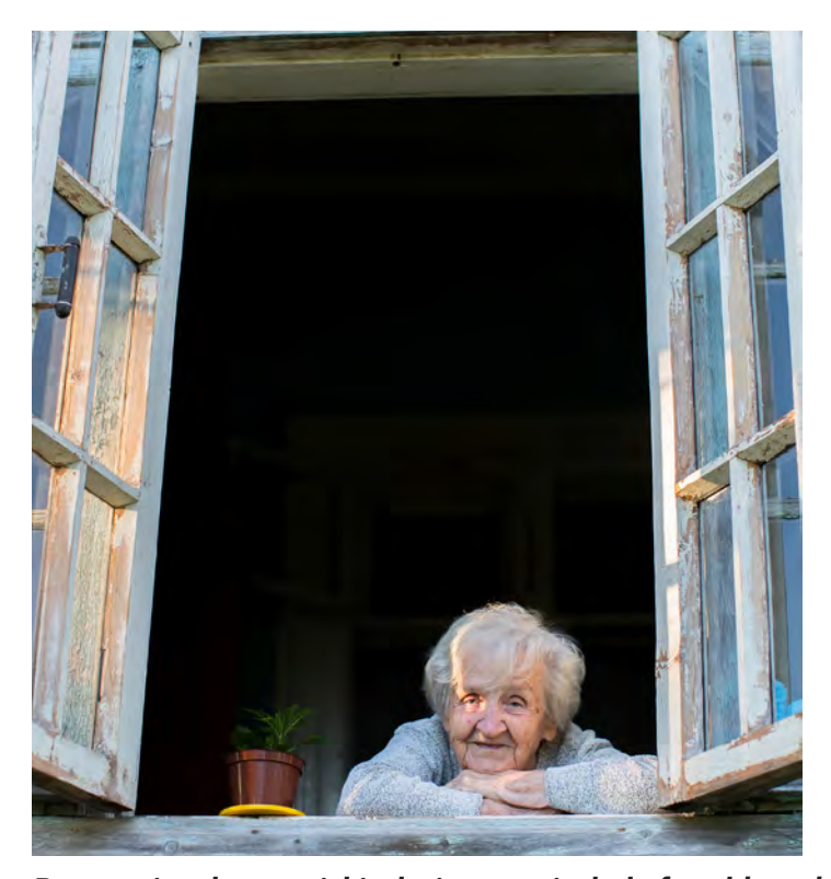
Respect involves social inclusion, particularly for older adults.

Through a partnership with Sixty & Better, city community centers are working to provide intergenerational and inclusive programming. Currently, the Age-Friendly Action Team provides programming activities at Linwood Square.