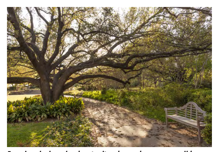
Ensuring shade and a place to sit makes parks more accessible.