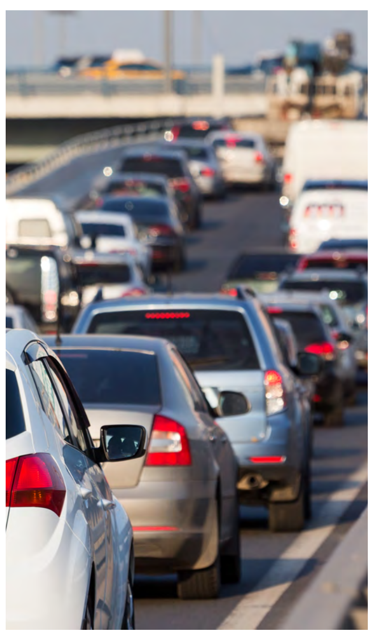
Better street design and public transportation can reduce traffic.