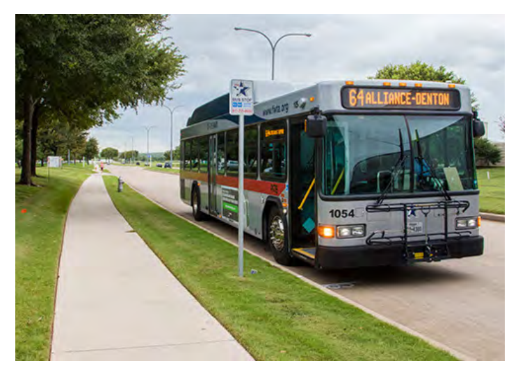
Public transit options must be affordable and convenient to use.

Develop and maintain a master list that outlines transportation eligibility requirements, services provided, boundaries covered and cost per trip.