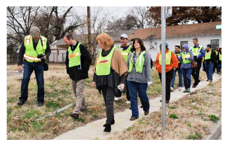
Older adults value giving back to their community.

Develop a series of easy-to-comprehend fact sheets on topics, practices and resources to identify home-based, part-time and job-sharing employment opportunities, age discrimination claims, and starting a business.