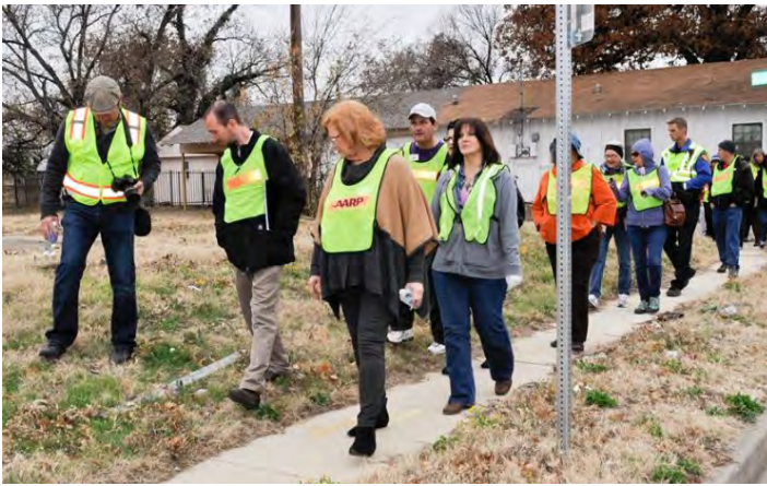
Older adults value giving back to their community.