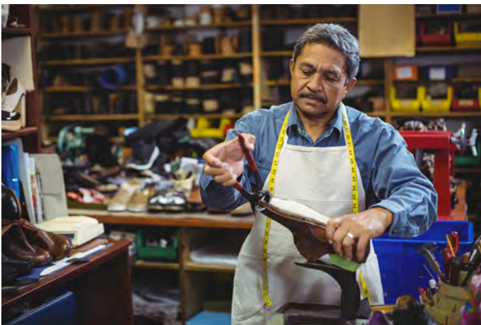
Starting a business can be a productive outlet for older adults.