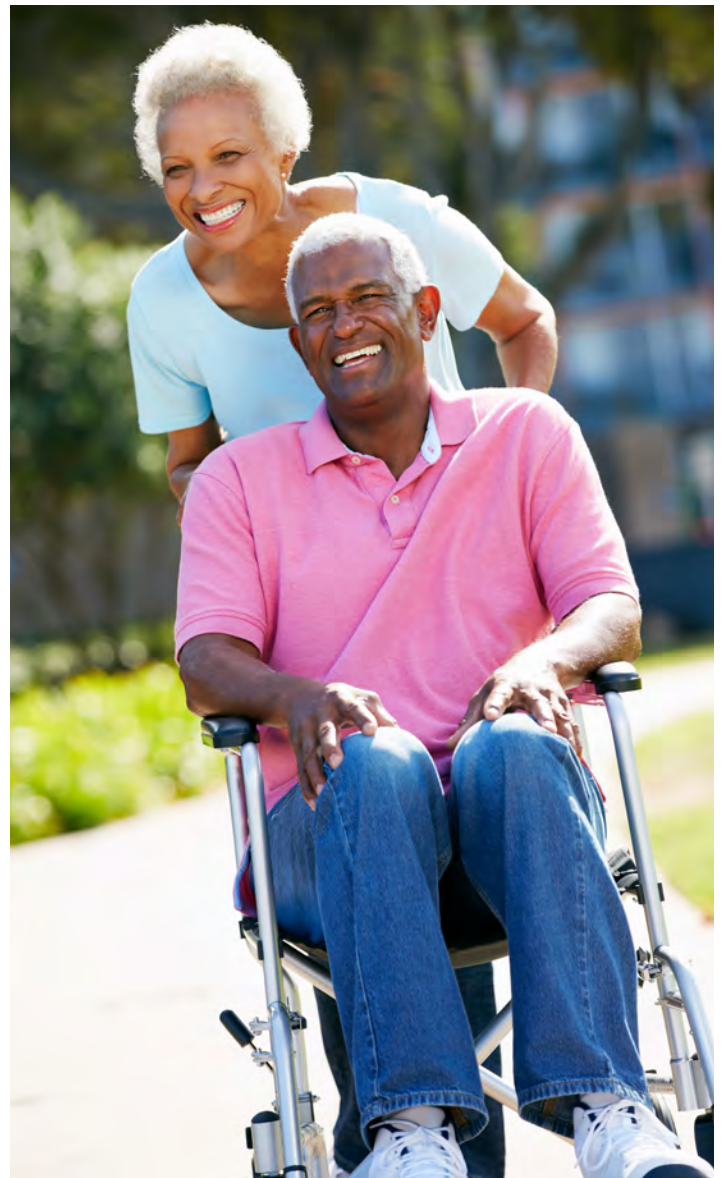
Outdoor spaces and buildings must be accessible for all residents.