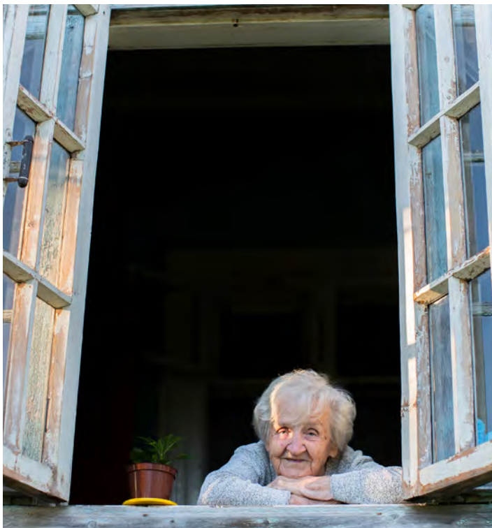
Respect involves social inclusion, particularly for older adults.