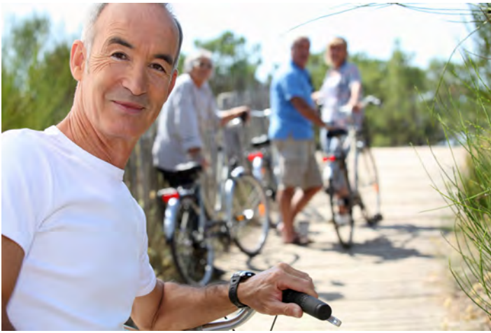
Wellness requires older adults to stay social and interact.