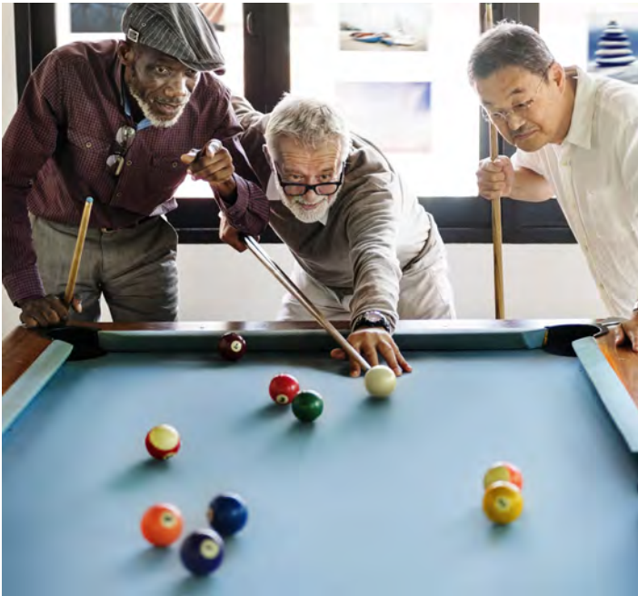
Recreational opportunities allow older adults to socialize.