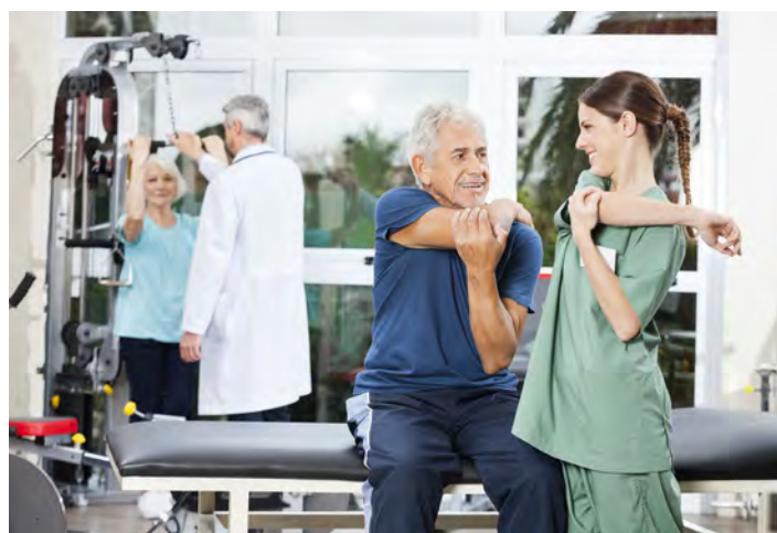
Everyone wants access to quality healthcare.