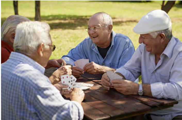
Fort Worth needs engaging activities to connect older adults.