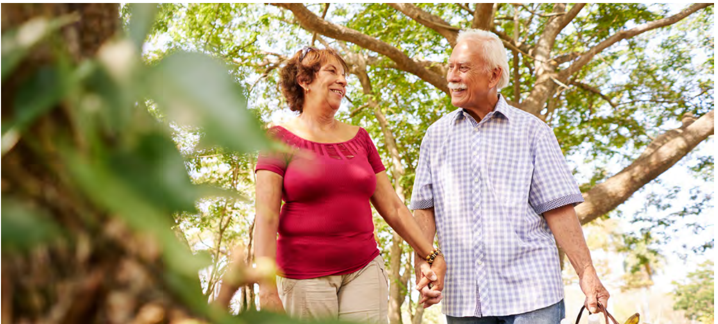
Parks offer older Fort Worthians the chance to enjoy nature.