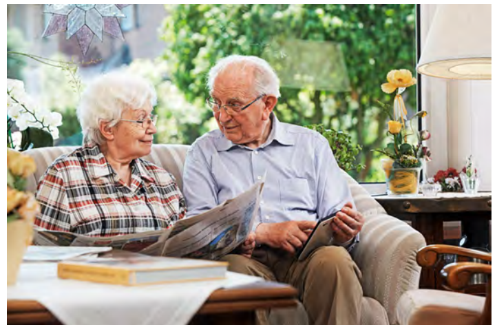
To age in place, older residents requires age-friendly homes.