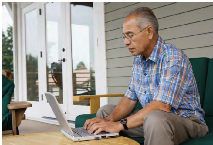
Keeping older adults informed can be easier with technology.