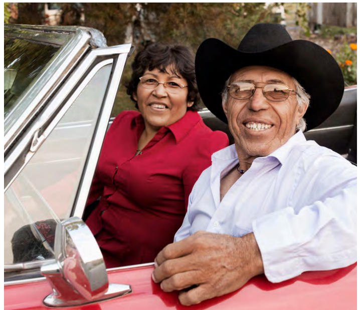
Driving and independence are closely tied together.