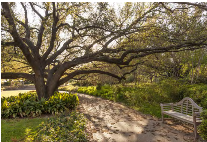
Ensuring shade and a place to sit makes parks more accessible.