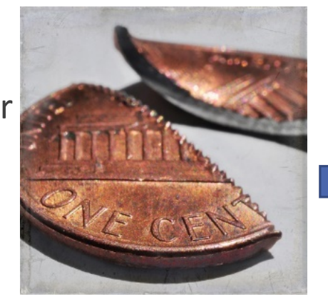
What can $3.1 Million do for Rosemont?