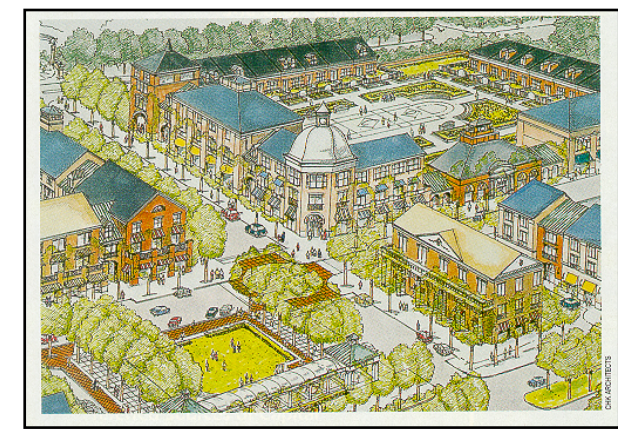
Urban villages are characterized by a mix of uses and open space with densities and designs that encourage transit and pedestrian activity.

This brochure provides information on the benefits of mixed-use urban development, the community planning process behind the program, the locations of sixteen urban villages, and three principal development strategies.