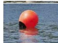
POWER CABLE MARKED WITH ORANGE BUOYS EVERY 1,000 FT.

POWER CABLE HAS BEEN PLACED ON THE BOTTOM OF THE LAKE (IT IS SAFE TO PASS OVER, BUT DO NOT ANCHOR BETWEEN THE BUOYS)