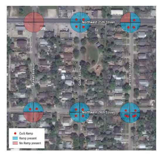
Figure 2. ADA Curb Ramp Example

The analysis assumes that each corner of an intersection should have at least one Americans with Disabilities Act (ADA)-compliant curb ramp. Each corner was examined to determine if a curb ramp was present. Score were calculated for intersections based on if there were curb ramps on zero, one-to-three, or four-or-more corners. See Figure 2 for examples. In the table, 1 is the best and 4 is the worst.