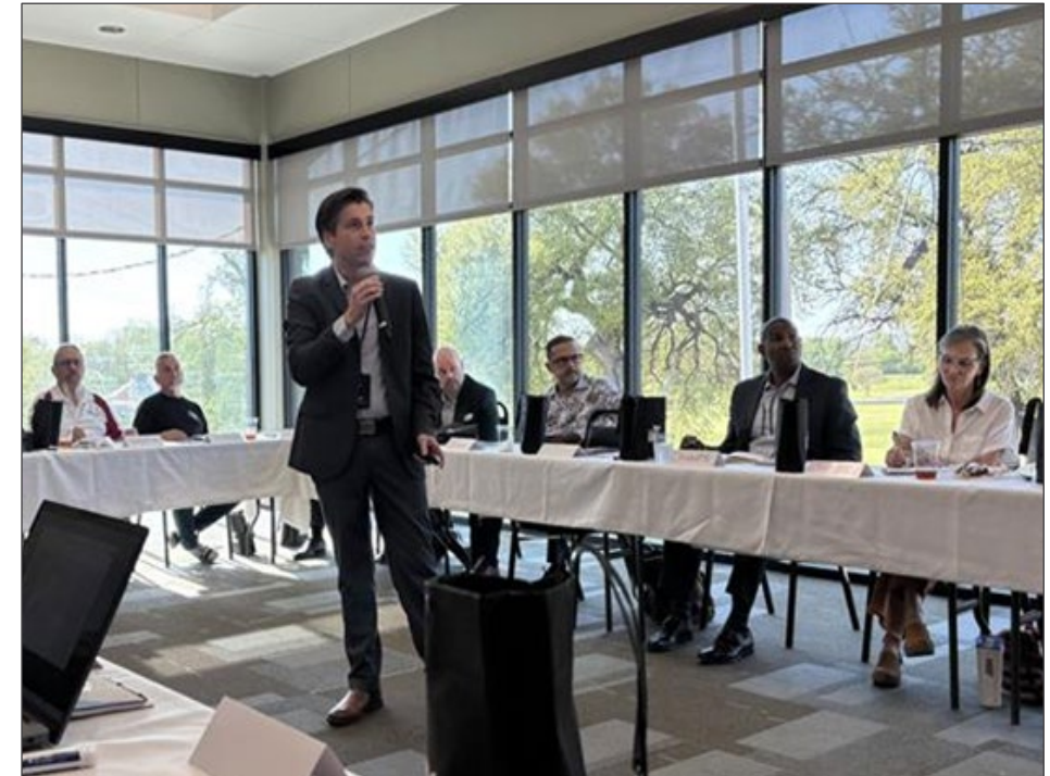
Community Focus Group kick-off meeting held on March 24, 2026.

Solid waste planning requires engaging stakeholders across the region.