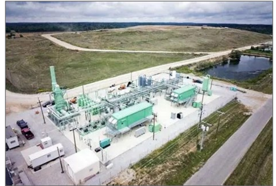
Archaea RNG facility in Fort Wayne, IN.

RNG revenues will be dedicated for future long range solid waste infrastructure/capital needs.