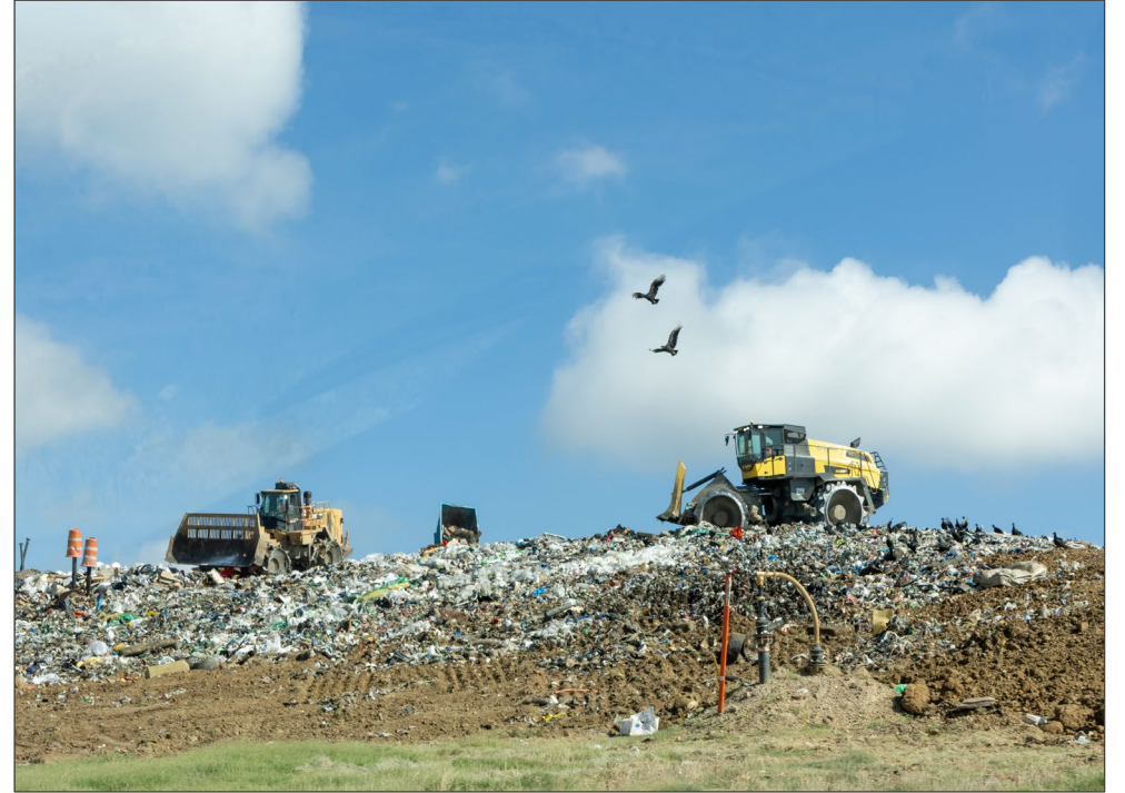
Operations at Southeast Landfill.

Staff will present leadership with a selection of strategies for consideration.