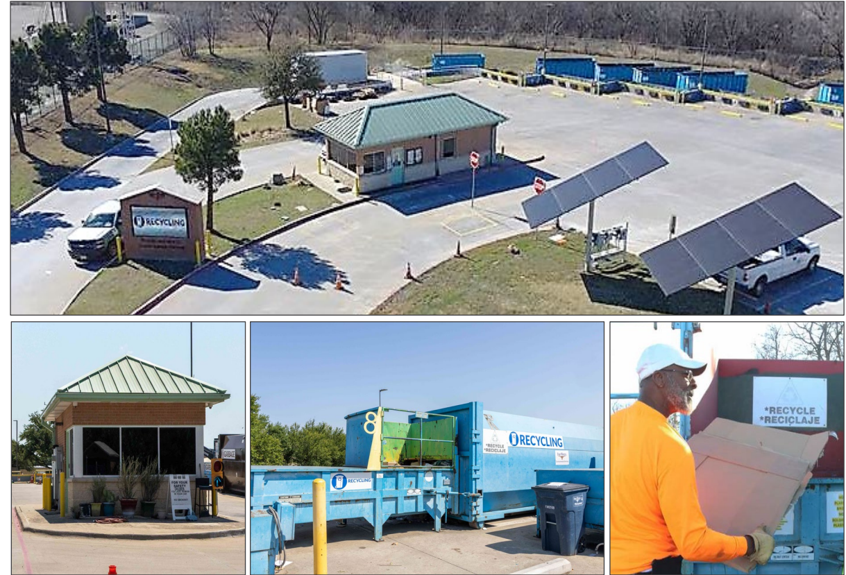
Various services at City Drop-Off Stations.