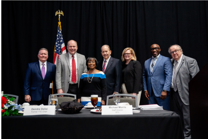
Mayor Pro Tem Gyna Bivens welcomed guests attending Infrastructure Summit 2024.

The August 8-9th event was hosted by the City of Irving and the North Texas Commission. This event showcased panel discussions dedicated to addressing crucial infrastructure vital for sustaining the region's growth. You may ask, WHY is Fort Worth's MPT welcoming guests to an event held in Irving? The event featured a celebration of the 50th Anniversary of the Regional Transportation Council, of which MPT Bivens is the Immediate Past Chair.