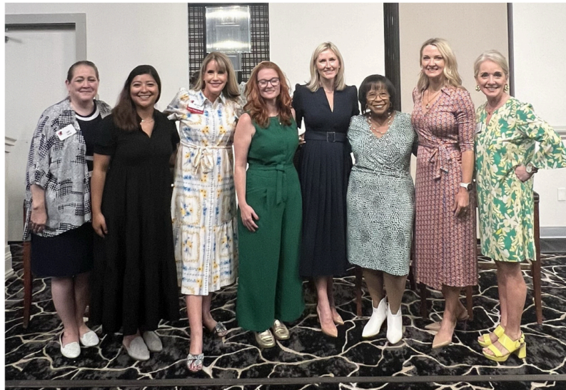
Every representative shared their experiences and gave updates on significant local initiatives in their districts, along with personal projects aimed at improving city services.