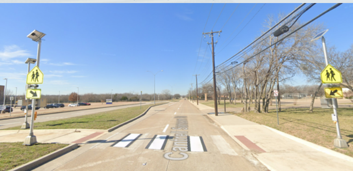
Northbrook Elementary School