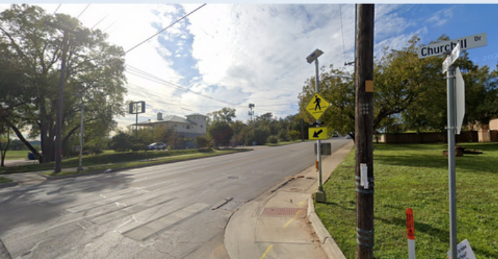
Castleberry High School