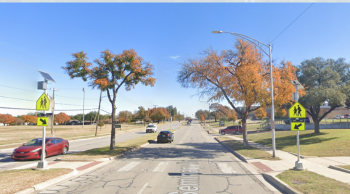
Rosemont Middle School