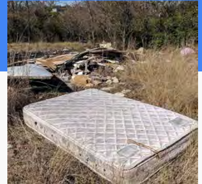
Illegal Roads and Dumping