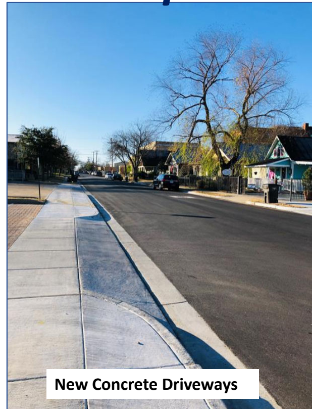
New Concrete Driveways