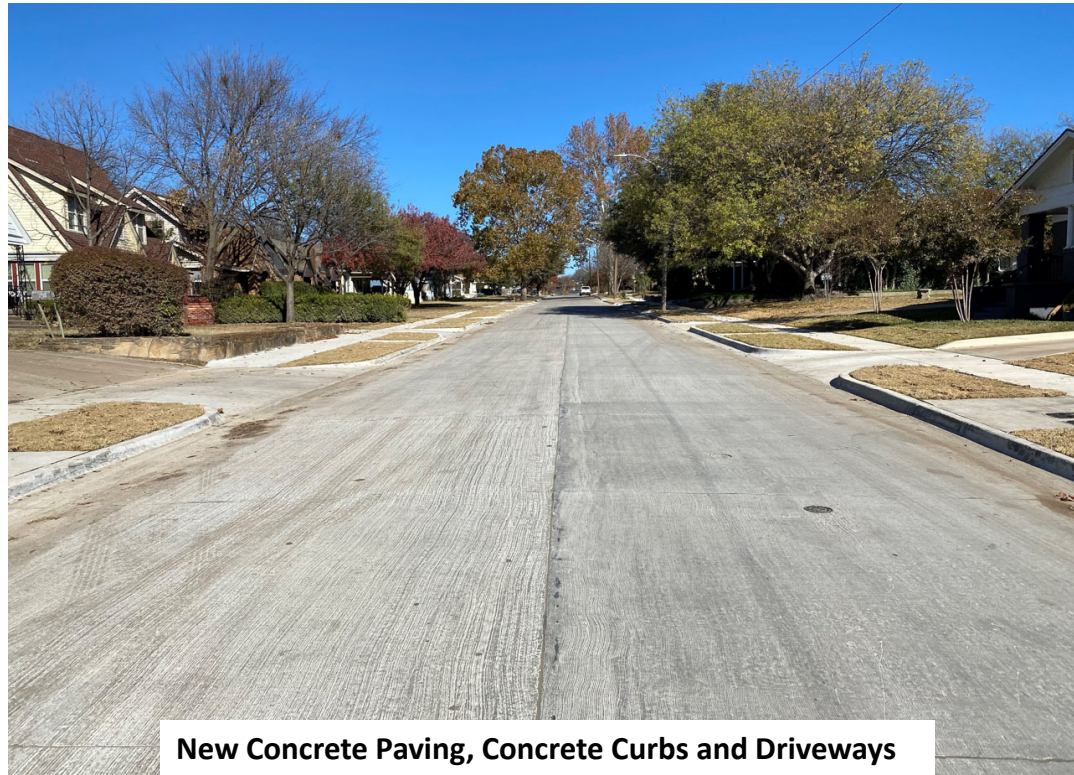
New Concrete Paving, Concrete Curbs and Driveways