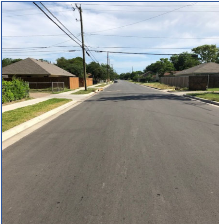
New Pavement and Concrete Curb & Gutter