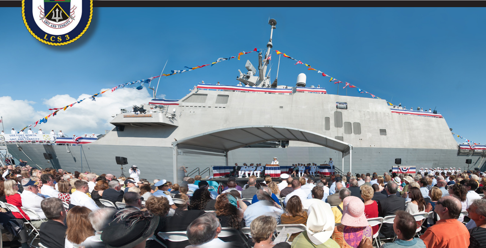
The USS Fort Worth, commissioned in Galveston, September 22, 2012