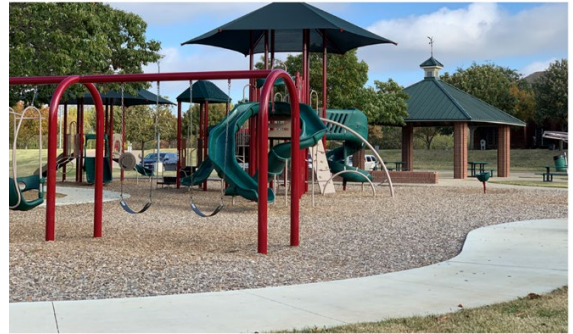
Arcadia Playground #2 (After)