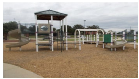
Arcadia Playground #2 (Before)

Constructed playground equipment was consistent with construction plan diagrams.