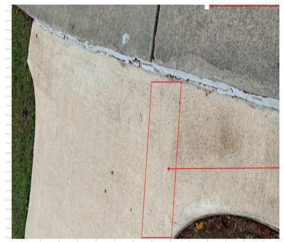
Arcadia Playground #6 (10/15/2021)

Since concrete work was required to complete the project, the City contracted with D&S Engineering Labs, LLC to provide geotechnical and material testing services related to the project. Based on our review of project documents, D&S Engineering Labs, LLC indicated they were not provided specific mix design standards by which to test the concrete, as was required by the contract. During audit fieldwork, Internal Audit observed faulty concrete that had also been identified by the Park and Recreation Department. The faulty concrete was repaired prior to the completion of our audit fieldwork. As noted in the following photographs, Internal Audit also observed what we considered to be small, hairline cracks in the concrete at playground #6. Upon inquiry, Park and Recreation Department staff indicated that the cracks were normal surface cracks. Internal Audit did not have the expertise to verify the cause of these cracks.