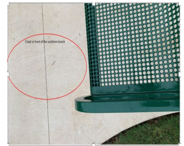
Arcadia Playground #6 (10/15/2021)