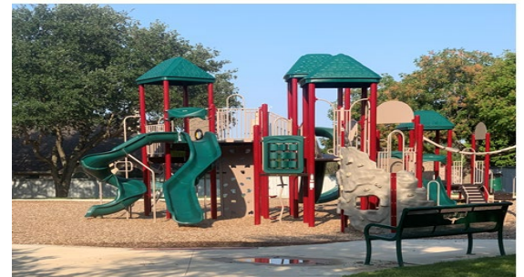
Arcadia Playground #5 (After)