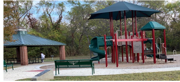
Arcadia Playground #6 (After)