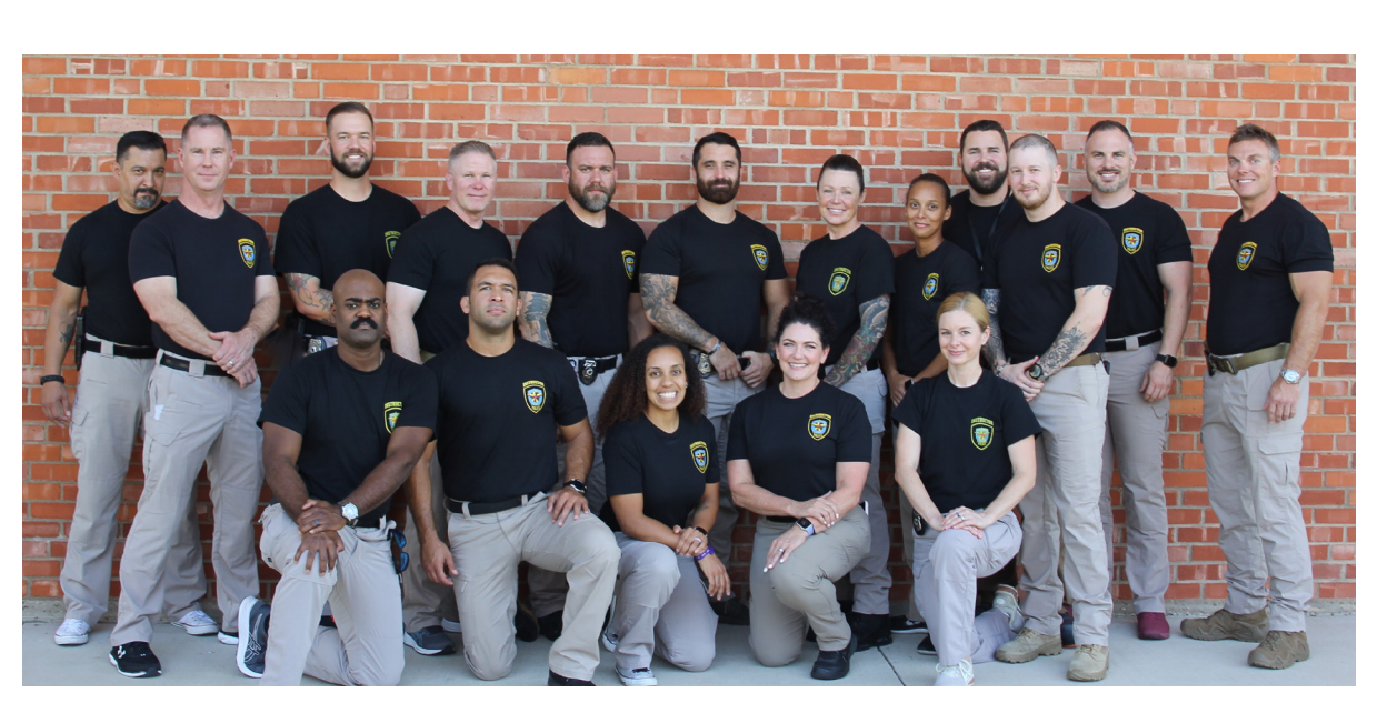
Recruit Training Unit