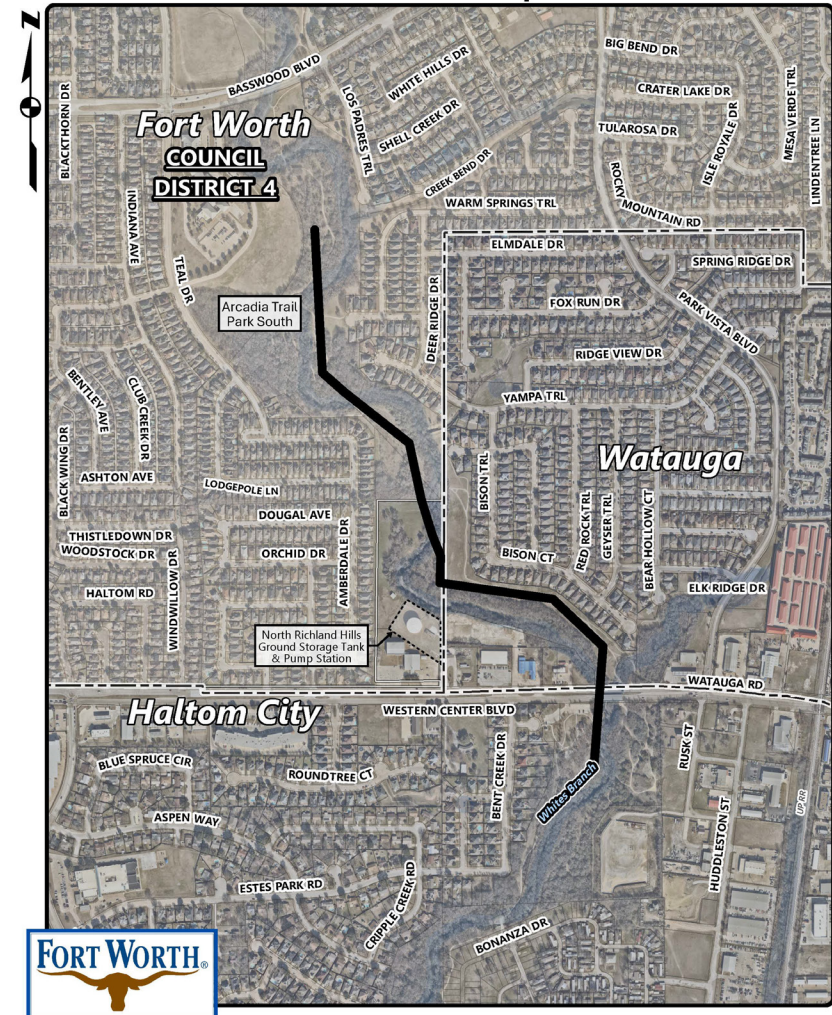
Arcadia Trail Area - 36-inch in diameter - Sewer Rehabilitation and Replacement

Construction may impact the Park Glen neighborhood association.