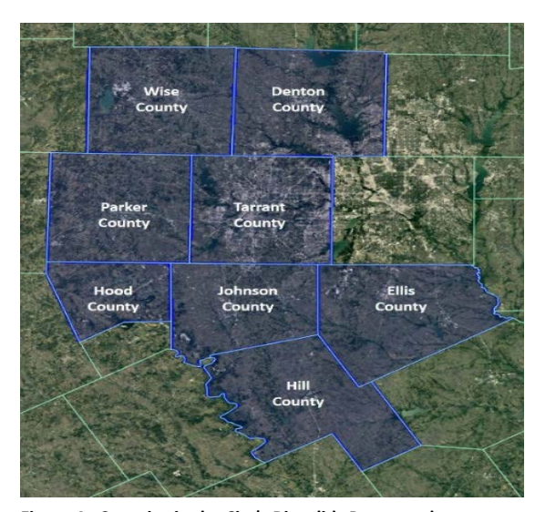
Figure 4. Counties in the City's Biosolids Program that can receive land application.