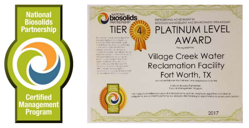
Figure 5. The City of Fort Worth's EMS has been certified by the NBP since July 2005.

Due to the maturity of the Fort Worth Biosolids Program, the City continues to certify at the Platinum Level with the NBP.