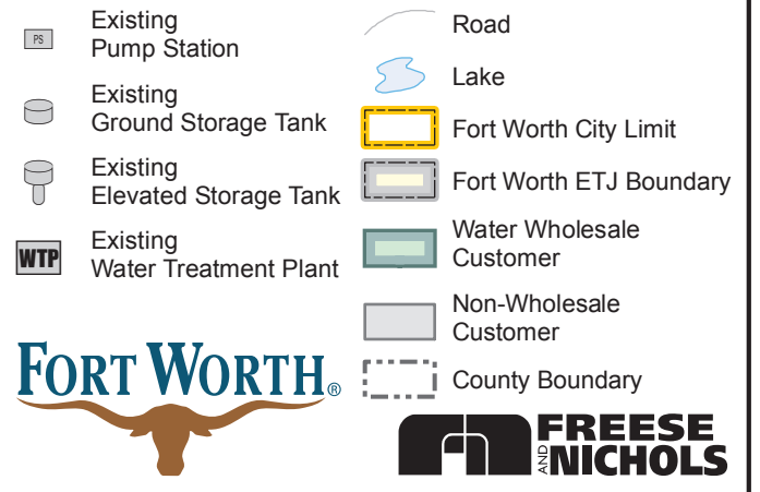
FIGURE D-1 CITY OF FORT WORTH 2017 WATER IMPACT FEE STUDY EXISTING FACILITIES LEGEND